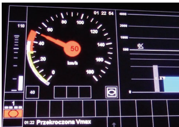
Fig. 3. DMI monitor during the tests

rameters (Fig. 5). Moreover, the so-called logs retrieved from the EVC ( European Vital Computer ) can also be used to verify the correctness of the telegrams read by the vehicle after receiving them from balises and RBC.