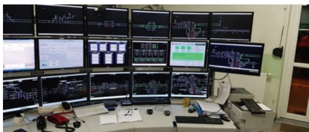
Fig. 4. Local control centre equipped with RBC

The data collected from these sources, video recordings, in-person observations made by qualified staff, and knowledge of the testing ground make it possible to perform professional and reliable assessments of the integration of the tested on-board and trackside subsystems. In questionable cases, the assessment process is significantly prolonged because it is necessary to carry out a detailed analysis of the occurring error to eliminate this error. System errors causing a sudden stop of the tested vehicle (TRIP), wrong movement parameters (e.g. travel speed set lower than the travel speed required), incorrect measurements of the distance covered or of the distance of the antenna from the last balise passed are only a fraction of the difficulties encountered during discussed tests. In most cases, small changes made in the vehicle's software offer a solution to the occurring problems. In extreme situations, however, it is necessary to replace individual components.