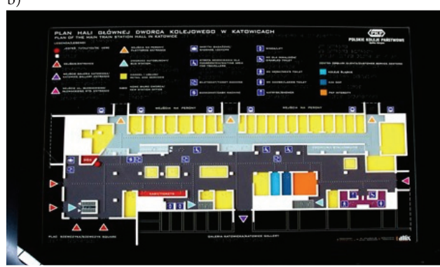
Plan of the main hall of the Katowice Station [16]