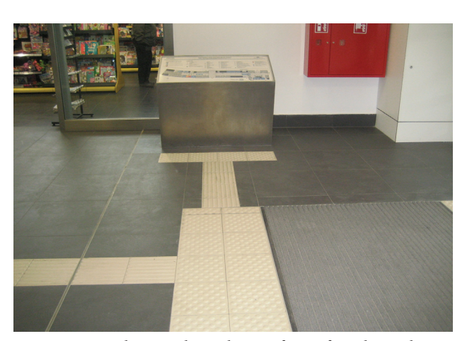
Fig. 2. Exemplary tactile marking in front of tactile graphics dedicated "to all" Rys. 2. Przykładowe oznakowanie dotykowe przed tyflografiką "dla wszystkich"

It should be emphasized that the observations field in the front of plan should prevent from slipping. The tactile graphic should stay cleaned out of snow and ice during winter time in the case it is exposed to the changing weather conditions. This also applies to a field surrounding the tactile graphics. Example of proper signage is shown in Figure 2.