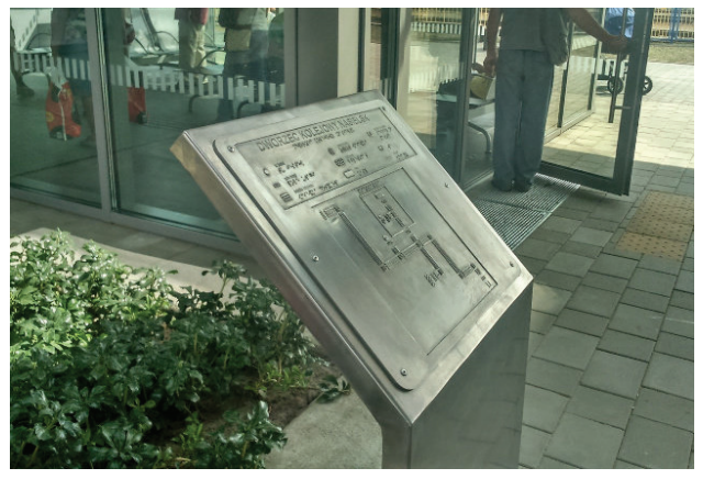
Fig. 4. Tactile graphics at the station in Nasielsk [14] Rys. 4. Tyflografika na dworcu w Nasielsku [14]

A different type of tactile graphic intended only for blind people was applied at the so-called innovative system railway stations. The name of the station was placed on the plan and the field "You are here" was clearly marked That significantly facilitated orientation in the station area. An example of tactile graphic for the blind people at the Nasielsk system station is shown in Figure 4. It should be noted that the legend is provided across the width of the plan and just below the title. Noteworthy is an aesthetic and vandal-resistant stand.