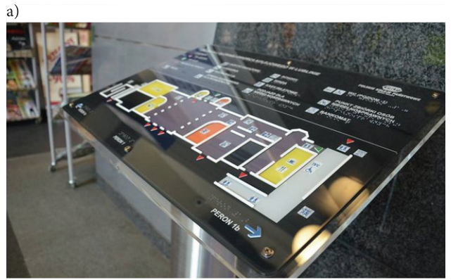
Plan of the main hall of the Main Lublin Station [15]