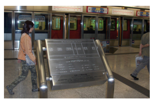
Fig. 1. Example of tactile graphics – subway station in Japan [18] Rys. 1. Przykład tyflografiki na stacji metra w Japonii [18]

In the case of railway stations plans dedicated "to all" that are placed indoors, be aware of their good lighting. The lighting parameters should be similar to those used to the wall train schedules.